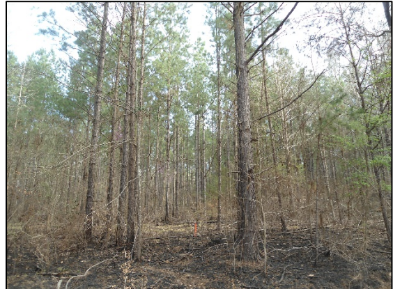
731 acres of loblolly pine plantations within a priority watershed in Nacogdoches County.