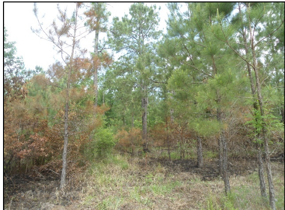
298 acre mixed species stand in Trinity County.