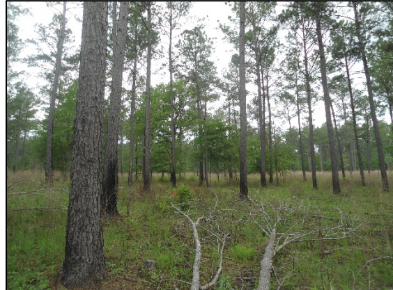
724 acres of mixed longleaf, shortleaf, loblolly pine stands in Houston County.